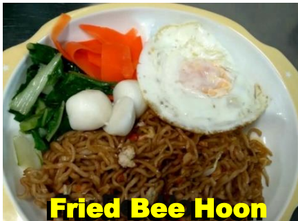
Fried Bee Hoon