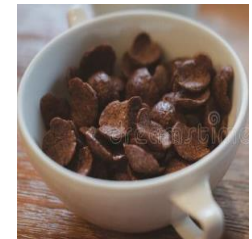
Koko Krunch $1.00