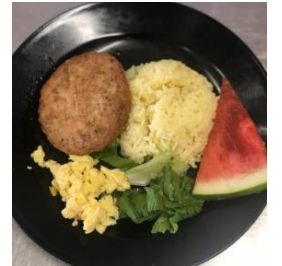
Patty Rice Set