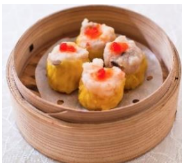
Siew Mai $0.70