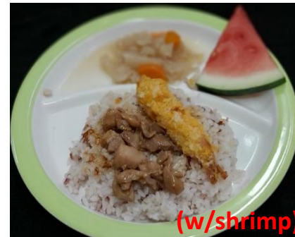
Ebi Tempura & Chicken Bento (Set 7)