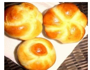
Assorted Buns $0.90