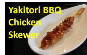
Yakitori BBQ Chicken Skewer