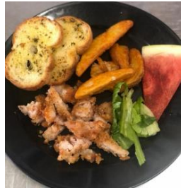
Chicken Chop Set A or B