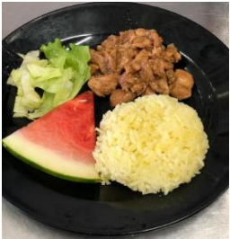
BBQ/Black Pepper/ Honey Chicken Set