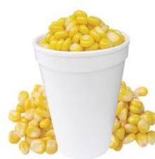
Steamed Corn Cup $1.00