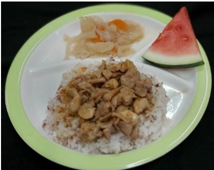
Teriyaki Chicken Bento (Set 1)