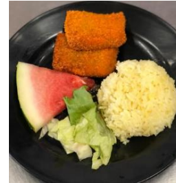
Fish Fillet Rice Set