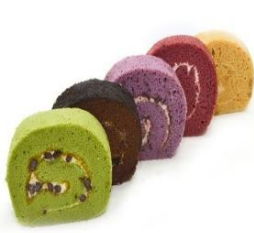
Swiss Roll $1.00