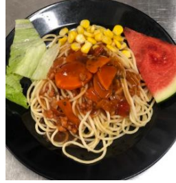
Spaghetti Bolognese Set