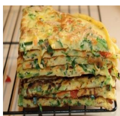
Vegetable Pancake $1.20