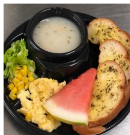
Garlic Bread Set