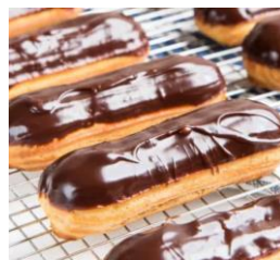
Chocolate Eclair $0.90