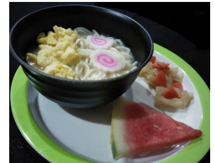
Paitan Ramen Soup Bento (Set 14)