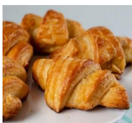
Mini Croissants $0.80 / $1.00