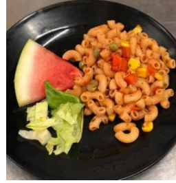
Macaroni Pasta/ Mac & Cheese Set