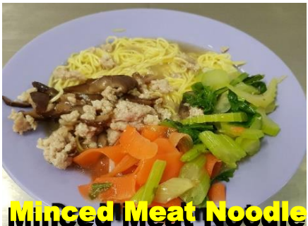
Minced Meat Noodle