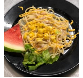
Cheese Pasta/ Aglio Olio Set