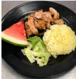
Chicken Chop Rice Set