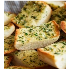
Garlic Bread $0.80