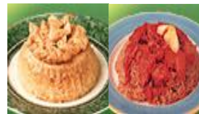
Loy Mai Kai / Fan Choy $1.70