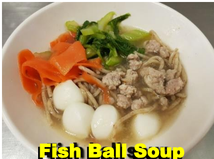
Fish Ball Soup