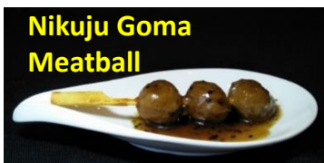
Nikuju Goma Meatball