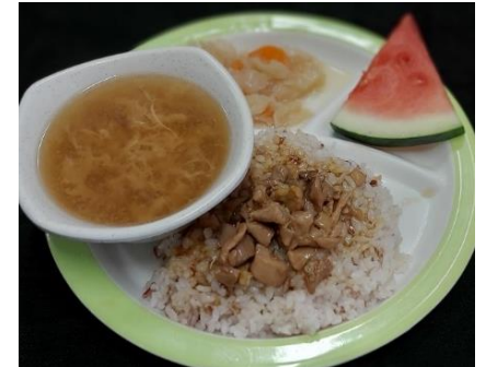
Yukigafuru Miso Soup & Chicken Bento (Set 8)