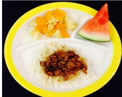
Yakitori Pork Bento (Set 2)