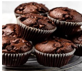
Chocolate Muffin $0.80