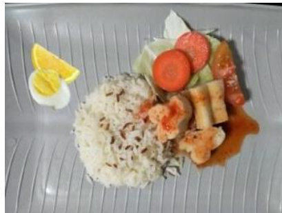
SWEET SOUR FISH