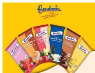
Gardenia Cream Roll (assorted) $1.30