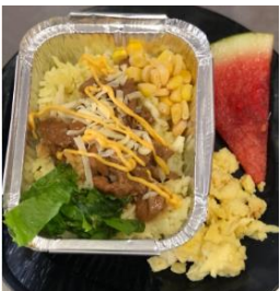
Cheese Baked Rice Set