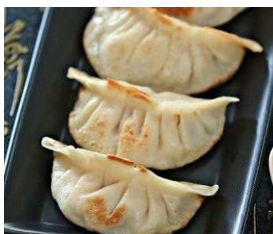
Dumpling (2pcs) $1.20