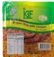
Nasi Briyani $2.50