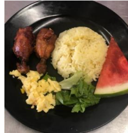
Marmite Chicken Rice