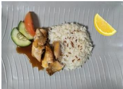
BBQ CHICKEN RICE