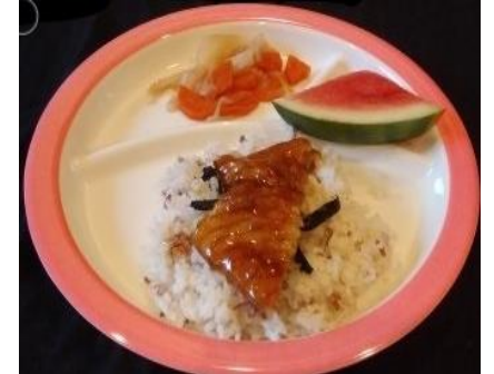
Kabayaki Fish Bento (Set 4)