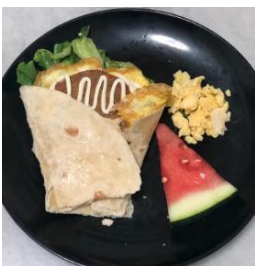
Patty Wrap Set