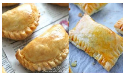
Assorted Puffs $1.00