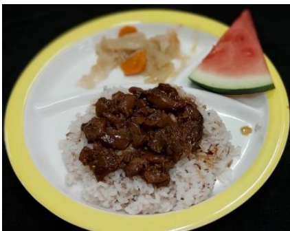
Yakiniku Chicken Bento (Set 5)