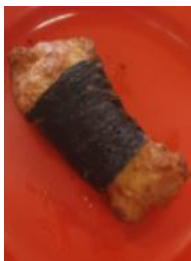
Rosti Potato & Seaweed chicken Shrimp twister $0.70