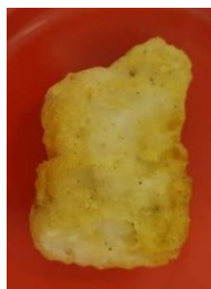
Chicken & Fish Nugget $0.50