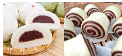
Assorted Sweet Pau $0.80 / $0.70