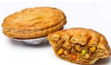
Chicken Pies $2.20