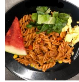
Fusilli Pasta Set