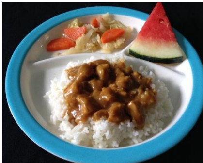
Tokushu Curry Chicken Bento (Set 6)