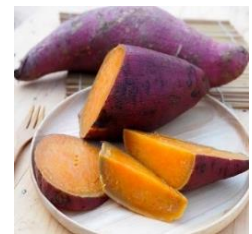
Sweet Potato $1.20