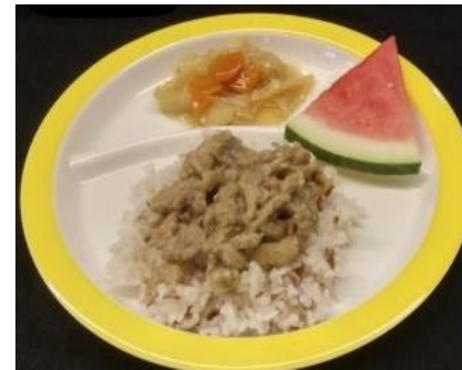
Oishi Black Pepper Chicken (Set 11)