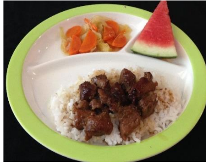
Hachimitsu Pork Bento (Set 3)