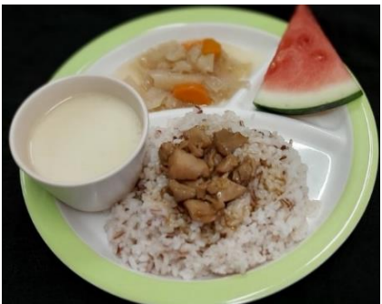
Chawanmushi & Chicken Bento (Set 9)