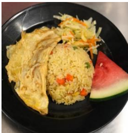
Omelette Cheese Rice Set