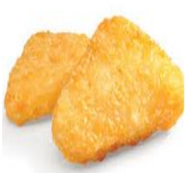
Hash Brown $0.90