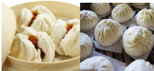
Assorted Chicken Meat Pau $1.00