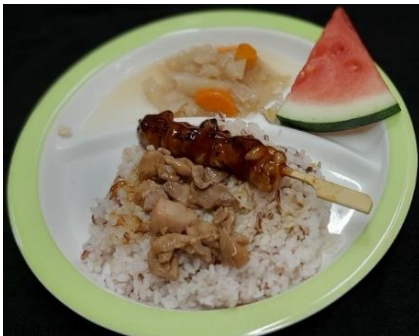
Yakitori BBQ Skewer & Chicken Bento (Set 10)