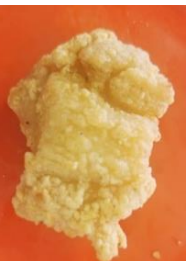
Chicken Cheeseball / Meatball $0.60 Shrimp ball $0.90