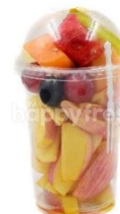
Mixed Fruits Cup $1.40