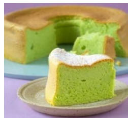
Chiffon Cake $0.80