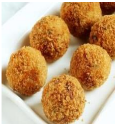
Baked Chicken Cheese Ball (2pcs) $1.20