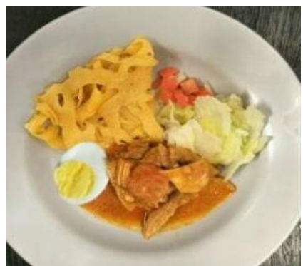
ROTI KIRAI / ROTI PRATA