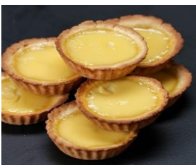
Egg Tart $1.00